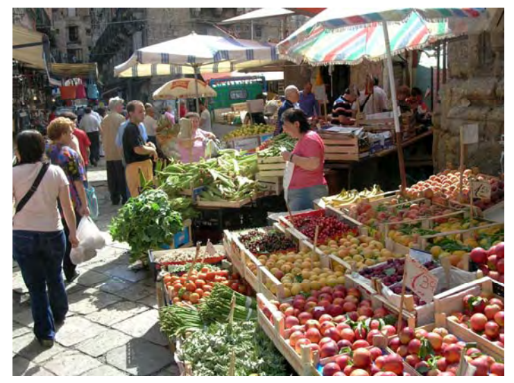
Mercato Ballero, a street market in Palermo, Sicily

Staying at Hotel Sicilia just off Via Maqueda for three nights, I experienced a lively, noisy, vital part of Palermo, several blocks from Stazione Centrale, the main train station, and a few blocks from Mercato Ballero, one of the large, street markets that carries the lingering flavor of a Middle Eastern bazaar, a legacy of over two centuries of Moorish (Arab) rule (831-1061 A.D.). In 2007, this part of the city is home to a mixture of immigrants— Sri Lankan, North African, Asian. Palermo has a significant immigrant population from Sri Lanka, where a civil war has been underway for over 25 years. As detailed below, many of our students of English were Sri Lankan.