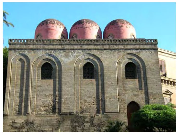
The Norman chapel of San Cataldo shows Arab influence.

Focus Europe <u>continued from previous page</u> this newsletter related to the politics, languages, and recent literature of Europe should help stimulate your thinking.