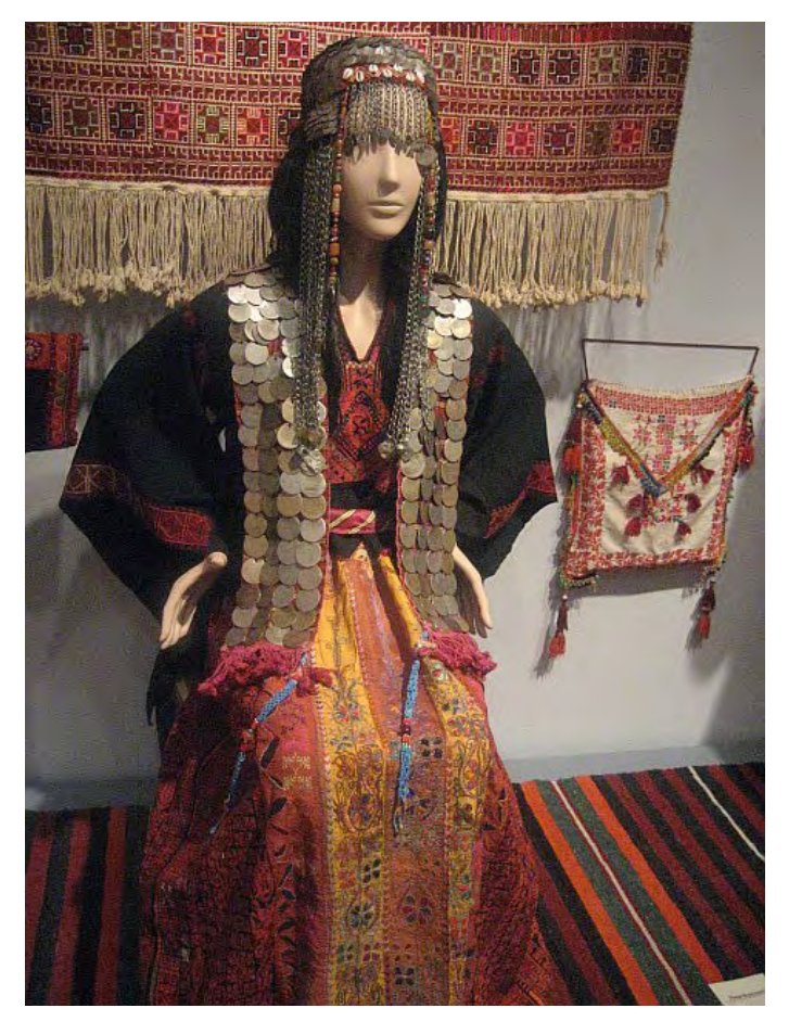
"Threads of Pride: Palestinian Traditional Costumes" runs through Nov. 25 at the Arab American National Museum

by diverse local and international performers, every Thursday evening this Fall at the Arab American National Museum (13624 Michigan Avenue, Dearborn). Tickets: $10 general admission, $12 at the door; discounts for students, AANM members, and series ticket holders. Full information can be found at http://www.theaanm.org