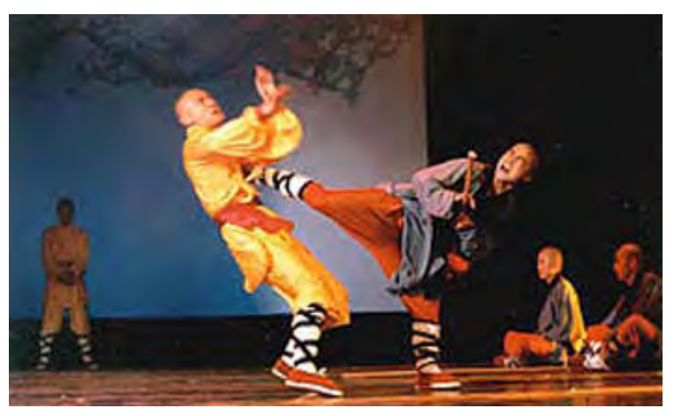
The Shaolin Warriors come to the Max M. Fisher Music Center on Nov. 20

Dec. 6, 2007: Symposium, "New Lines of Tolerance and Intolerance in Europe". Sponsored by UM Center for Russian and East European Studies and the European Union Center. 4–6 pm. Room 1636 International Institute (School of Social Work Bldg.), 1080 S. University Avenue, Univ. of Michigan, Ann Arbor.