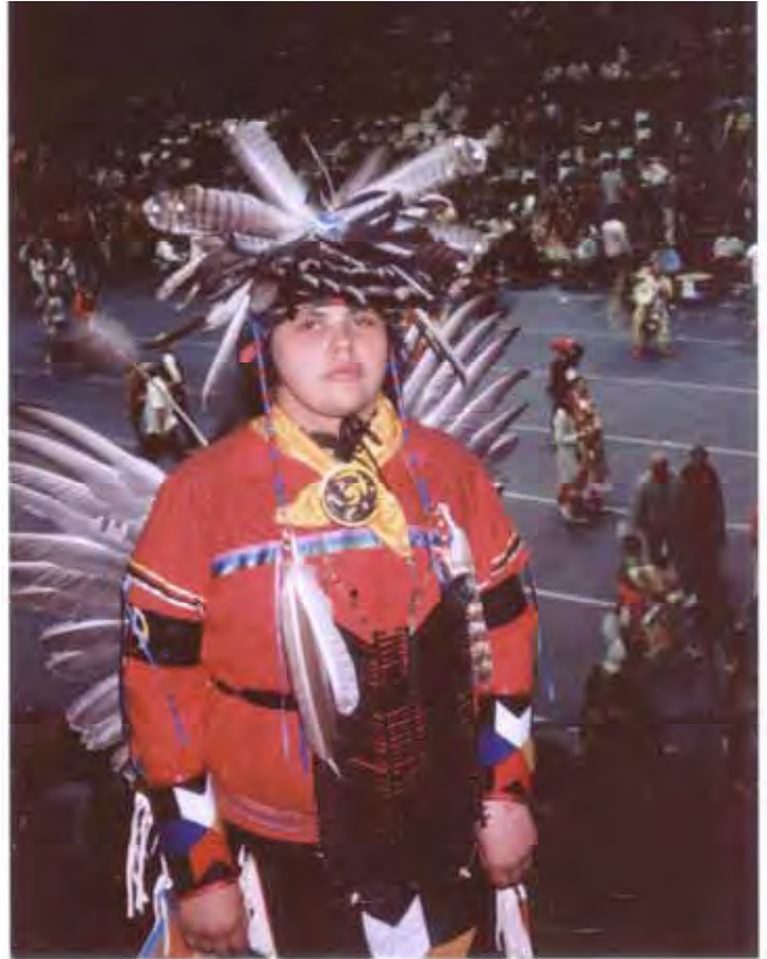
A young tribal member in his regalia at the Pow Wow.

The Grand Entry sets the tone, and creates a space, for the intertribals to dance together before the competition begins. Over 500 regalia-clad dancers participate, but all attendees, including non-native people, are welcome to join in this preliminary dance as the strength of the pow wow universe continues to emerge. All tribes of Michigan, along with other state tribes, are on the floor dancing to the pulse of the drums. The Ojibwe, Ottawa, Potawatomi, Shawnee, and Huron all enter the spirit circle of collective transcendence— the ancient universe of native life conjured forth where all are now inhabiting a sacred realm. Time stands still as the past, present, and future merge, and one glimpses the true nature of reality— a timeless moment of grace where all are shown the essence of existence. This is the eternal age of the world, the long history of native life, a sense of universal connectedness, a vast stream of feathered dancers, harmonious participation with Mother Earth, a montage of beaded color, buckskin, moccasins, head dresses— the young ones, the old ones, the in-between