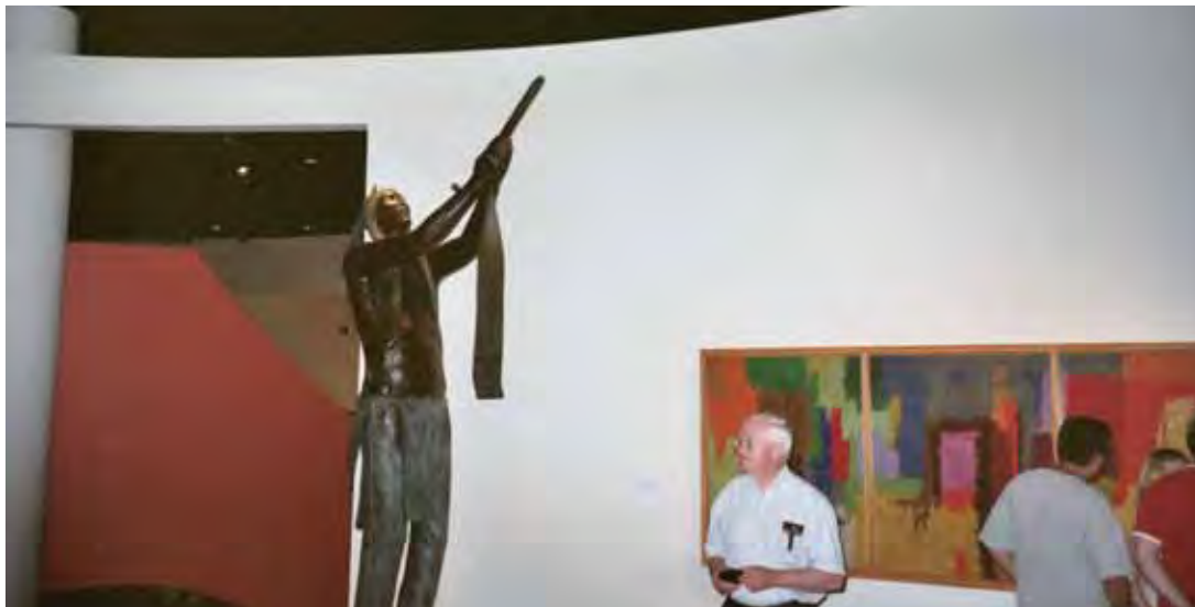
Part of "Native Modernism", an exhibit of contemporary native art last summer at the National Museum of the American Indian in Washington, D.C.

The NMAI takes its place beside other important Indian museums, notably the Eiteljorg Museum of American Indians and Western Art in Indianapolis and the Heard Museum in Phoenix, both of which I have visited in the past. There also exist a number of impressive new museums established by specific tribes, especially in the northeastern U.S. •