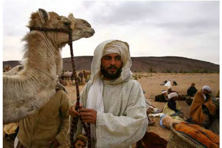
"Journey to Mecca: In the Footsteps of Ibn Battuta"