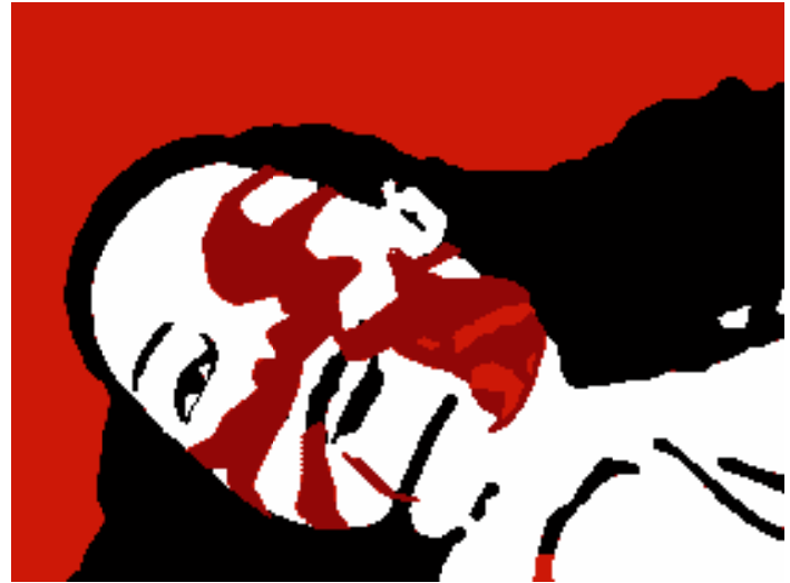
An iconic image of Neda in black, white, and red. http://weareallneda.com/

"Her name was (Neda), which means voice or call in Farsi. She is the voice of the people, a call to freedom."